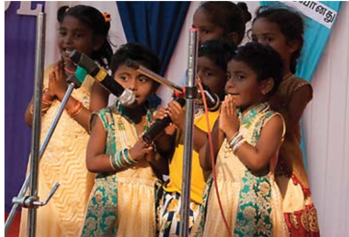
ANNUAL DAY PHOTO COLLAGE